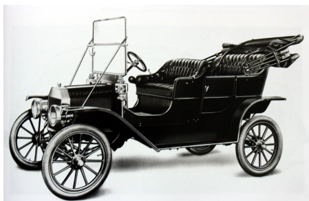
The Ford Model T—Henry Ford paid an engineering consultant $100,000 to fix his assembly line!

"Cost for screw: 15 cents... knowing where to put the screw: $99,999.85"